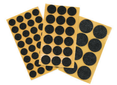
Kingston Self Adhesive Felt Pads