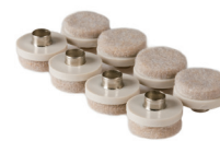
Kingston Nail-In Felt Pads