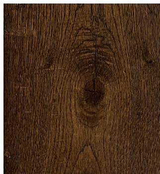
Image shows Rustic option.

Should you require the information on any other details please contact the sales team on 020 8501 6730 or info@wfa.uk.net