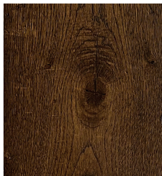
Image shows Rustic option.

Should you require the information on any other details please contact the sales team on 020 8501 6730 or info@wfa.uk.net